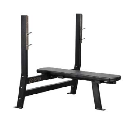
Bench Press with Fixed Bar Holder