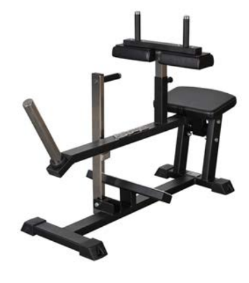
Calf Press, Seated Art.nr: 145

Length: 140 cm Width: 60 cm Height: 85 cm