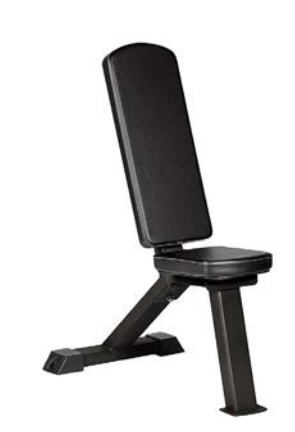
Fixed Bench 70 degrees Art.nr: 153

Length: 76 cm Width: 40 cm Height: 92 cm