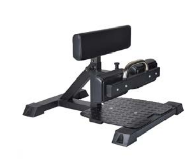
Sissy Squat Art.nr: 144

Length: 77 cm Width: 64 cm Height: 57 cm