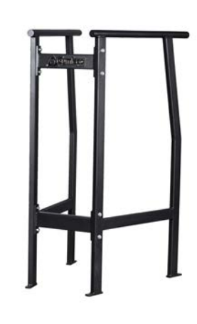
Dip Press stand Art.nr: 155

Length: 80 cm Width: 80 cm Height: 140 cm