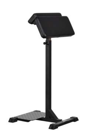
Scott Curl Bench, standing Art.nr: 152

Length: 63 cm Width: 53 cm Height: 92 cm