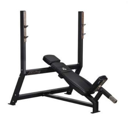
Incline Bench Press Art.nr: 120

Length: 125 cm Width: 150 cm Height: 124 cm