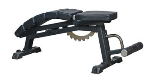
Leglift with dips Art.nr: 173

Length: 70 cm Width: 91 cm Height: 143 cm