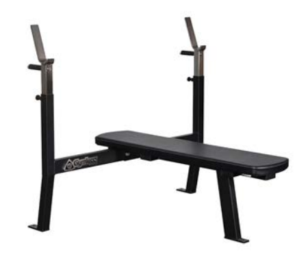
Bench Press Stand with Adjustable Bar Holders