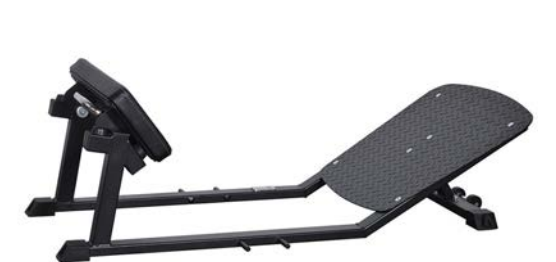
Hip Thrust bench Art.nr: 166

Length: 150 cm Width: 73 cm Height: 50 cm