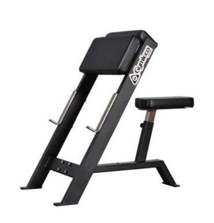
Scott Curl Bench, seated Art.nr: 151

Length: 101 cm Width: 70 cm Height: 95 cm