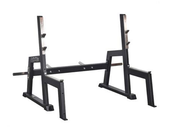
Stand for Decline Bench Art.nr: 154

Length: 125 cm Width: 170 cm Height: 110 cm