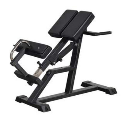
Back Raise, Adjustable Art.nr: 162

Length: 102 cm Width: 60 cm Height: 117 cm