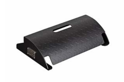
Calf Raise Block Art.nr: 146

Length: 51 cm Width: 31 cm Height: 13 cm