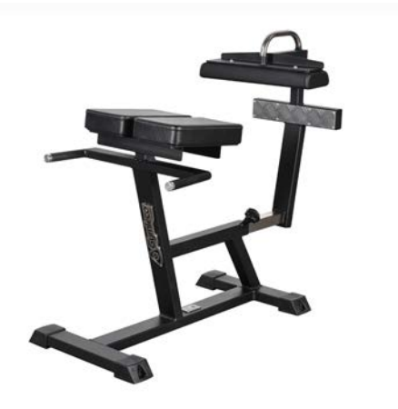
Back Raise, 90 degrees Art.nr: 162F90

Length: 102 cm Width: 60 cm Height: 104 cm