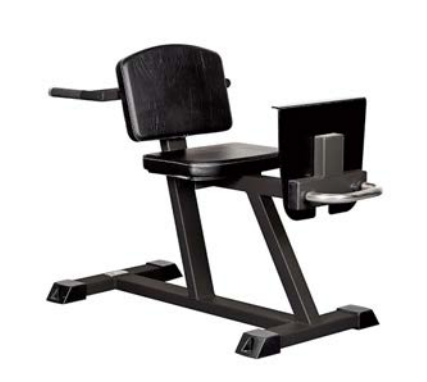
Back Raise, Knee standing