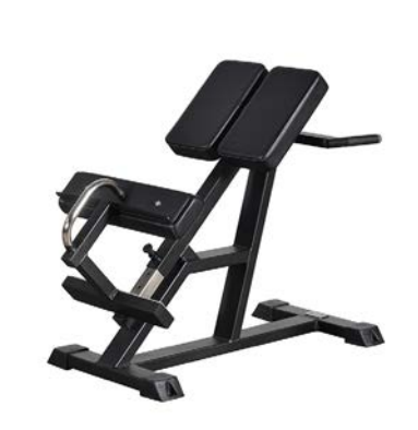
Back Raise, 45 degrees Art.nr: 162F45

Length: 102 cm Width: 60 cm Height: 117 cm