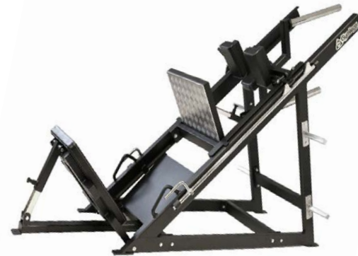
Leg Press/Hack Lift Combination Art.nr: 245

Length: 230 cm Width: 81 cm Height: 145 cm