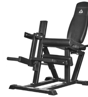
Leg Extension Art.nr: 040

Weight: 125 kg Start weight in the handles: 21 kg