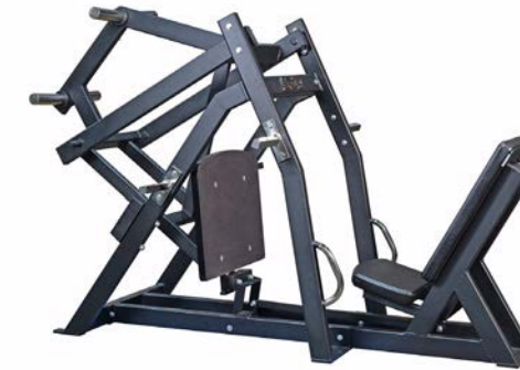
Leg Press Art.nr: 043

Length: 226 cm Width: 78 cm Height: 180 cm