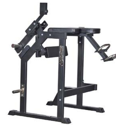
Reverse Hyper Art.nr: 061

Length: 116 cm Width: 140 cm Height: 144 cm