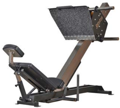
Leg Press Art.nr: 243

Length: 218 cm Width: 78 cm Height: 142 cm