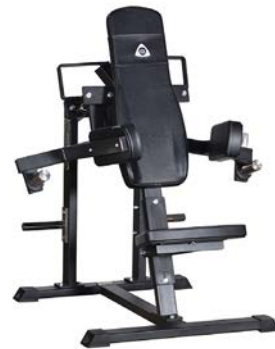
Shoulder Rotation Art.nr: 031

Length: 105 cm Width: 114 cm Height: 135 cm