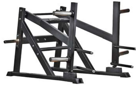
Deadlift / Squat machine Art.nr: 083

Length: 140 cm Width: 130 cm Height: 82 cm