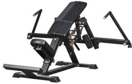
Pec Deck, Individual arms Art.nr: 023

Length: 155 cm Width: 164 cm Height: 93 cm