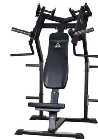
Lateral Incline Press Art.nr: 020

Length: 110 cm Width: 113 cm Height: 177 cm