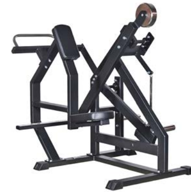
Gluteus, One Leg kick Art.nr: 060

Length: 126 cm Width: 119 cm Height: 133 cm