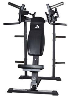
Shoulder Press Art.nr: 030

Length: 130 cm Width: 114 cm Height: 149 cm