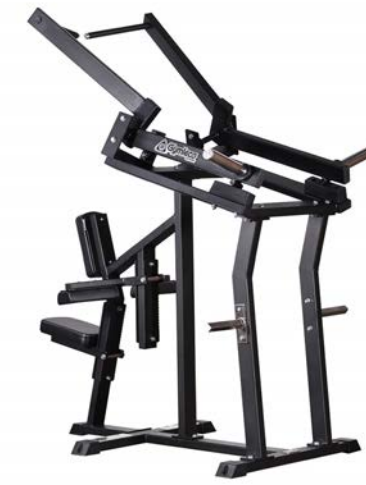
Iso Lateral Pulldown Art.nr: 011

Length: 156 cm Width: 104 cm Height: 199 cm