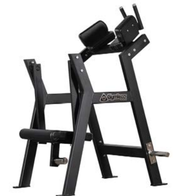
Ab Roll up Art.nr: 072

Length: 100 cm Width: 96 cm Height: 140 cm