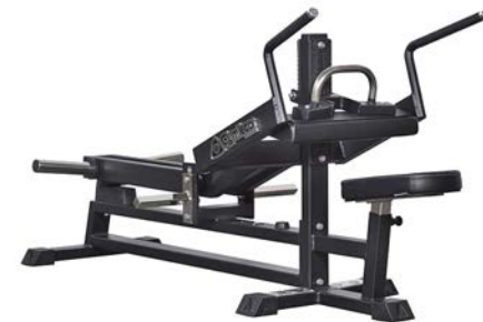
Dip Press Art.nr: 055

Length: 190 cm Width: 70 cm Height: 90 cm