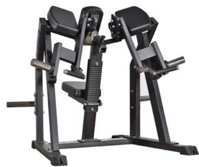
Iso Lateral Biceps Art.nr: 050

Length: 104 cm Width: 120 cm Height: 103 cm