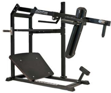
Pendulum Squat Art.nr: 045

Length: 191 cm Width: 87-110 cm Height: 163 cm