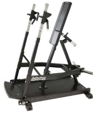
Chest Press, Standing Art.nr: 028

Length: 152 cm Width: 100 cm Height: 163 cm