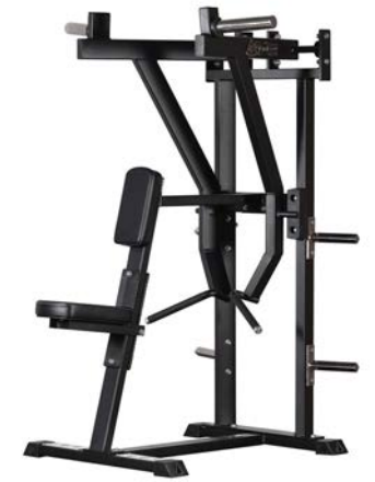
Iso Lateral Low Row Art.nr: 012

Length: 120 cm Width: 112 cm Height: 174 cm