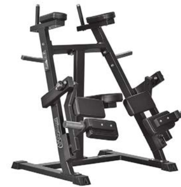
Leg Curl Standing Art.nr: 042

Length: 96 cm Width: 117 cm Height: 123 cm