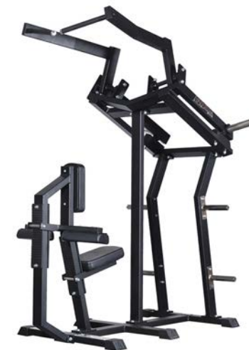
Iso Lateral High Row Art.nr: 013

Length: 160 cm Width: 110 cm Height: 198 cm