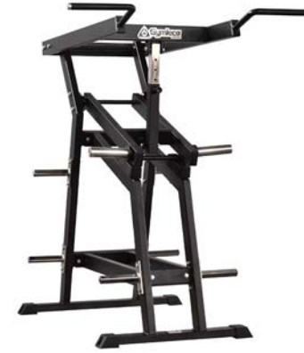
Viking Press Art.nr: 038

Length: 121 cm Width: 98 cm Height: 154 cm