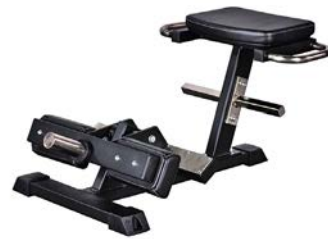
Tibia Dorsi Flexion Art.nr: 047

Length: 102 cm Width: 60 cm Height: 51 cm