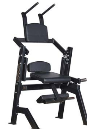
Abdominal Seated Art.nr: 070

Length: 83 cm Width: 114 cm Height: 168 cm