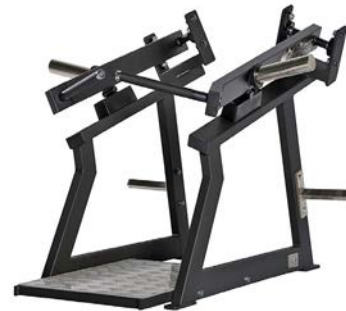
Upright Row Art.nr: 032

Length: 120 cm Width: 140 cm Height: 94 cm