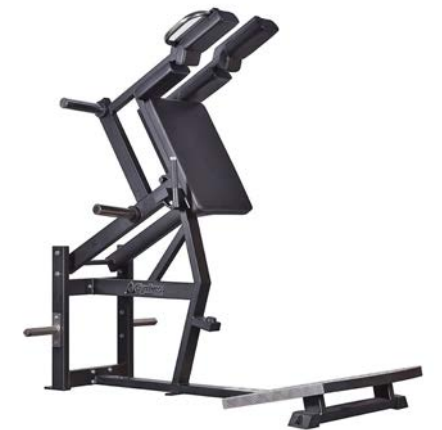
Squat / Hack Squat Art.nr: 044

Length: 177 cm Width: 85 cm Height: 156 cm