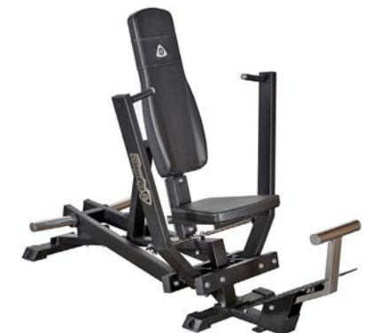
Lateral Wide Chest Art.nr: 021

Length: 180 cm Width: 104 cm Height: 137 cm