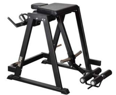
Reverse Hyper Pendulum Art.nr: 062

Length: 137 cm Width: 133,5 cm Height: 111 cm