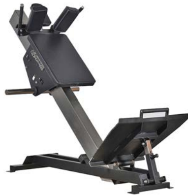
Hack Lift 45° Art.nr: 244

Length: 195 cm Width: 80 cm Height: 145 cm