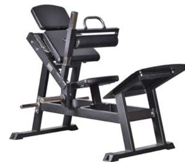
Hip Thrust machine Art.nr: 066

Length: 160 cm Width: 96 cm Height: 124 cm