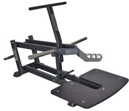
Belt Squat machine Art.nr: 082

Length: 170 cm Width: 100 cm Height: 115 cm