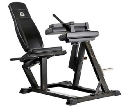
Leg Curl Seated Art.nr: 041

Length: 125 cm Width: 100 cm Height: 110 cm