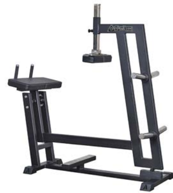
Donkey Raise Art.nr: 046

Length: 146 cm Width: 65 cm Height: 156 cm