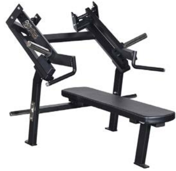
Iso Lateral Bench Press Art.nr: 022

Length: 163 cm Width: 133 cm Height: 114 cm