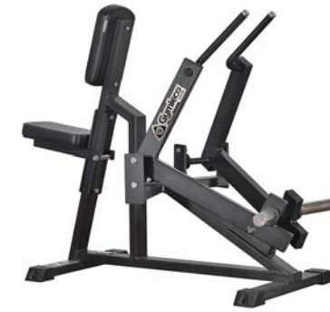
Seated Row Art.nr: 010

All the machines have black frames as standard color and black or red cushions. Read more about each product on our website: www.gymleco.com