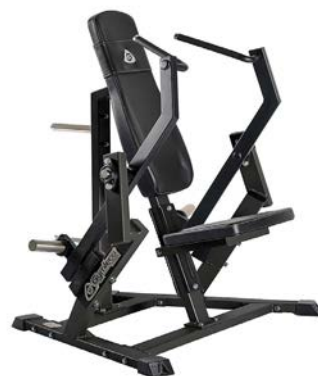
Iso Lateral Triceps Art.nr: 051

Length: 124 cm Width: 102 cm Height: 136 cm